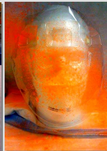
Figure 2: Simulated patient-generated exposure, such as sneeze, cough or other droplet-borne contagion.