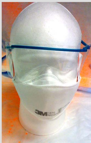
Figure 1: Standard (old) Practice: Disposable eye protection with N95 Mask