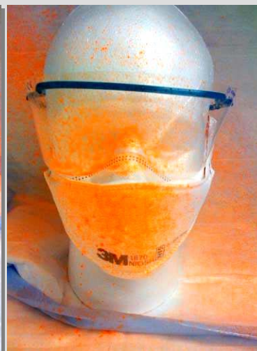
Figure 2: Simulated patient-generated exposure, such as sneeze, cough or other droplet-borne contagion.