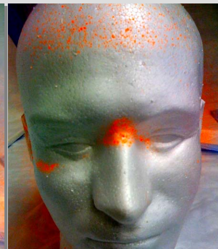
Figure 3: PPE removed, exposure is significant.