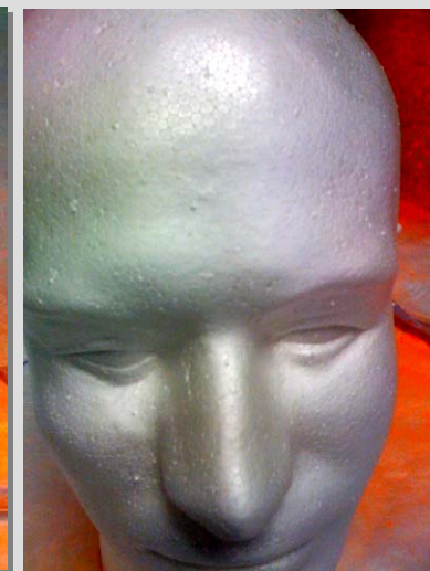
Figure 3: PPE removed, exposure not observable .