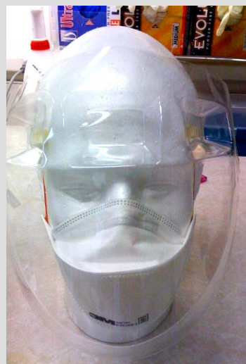
Figure 1: Disposable BetterShield with N95 Mask