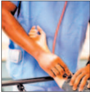
gelFAST hand sanitizer, a winner on Dragon's Den , can clip on belts or lab coats.